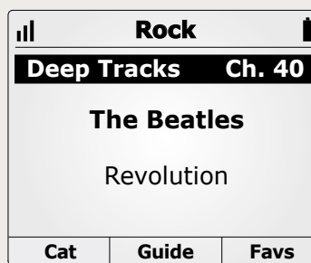
XM "Now Playing" Category, Channel Name, Channel #, Artist and Song